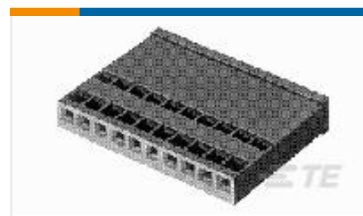
TE Part # 87175-3 15 LOCKING CLIP HSG SR MRKD