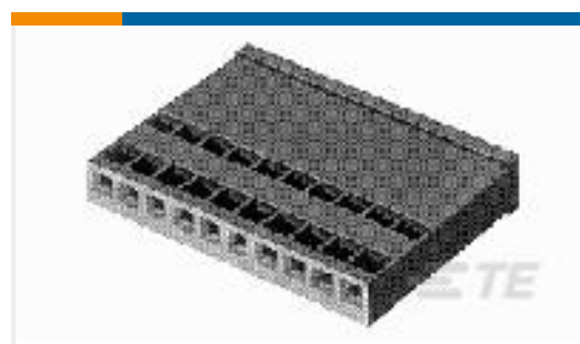
TE Part # 2-87175-2 10 LOCKING CLIP HSG SR .100CL